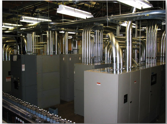
Data Room Power